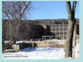
History has left the North Nashua River with architectural artifacts that provide many opportunities for rehabilitation, historic interpretation, and art.