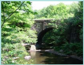
Glimpses of the North Nashua River: Natural areas and industrial history create unique landscapes.