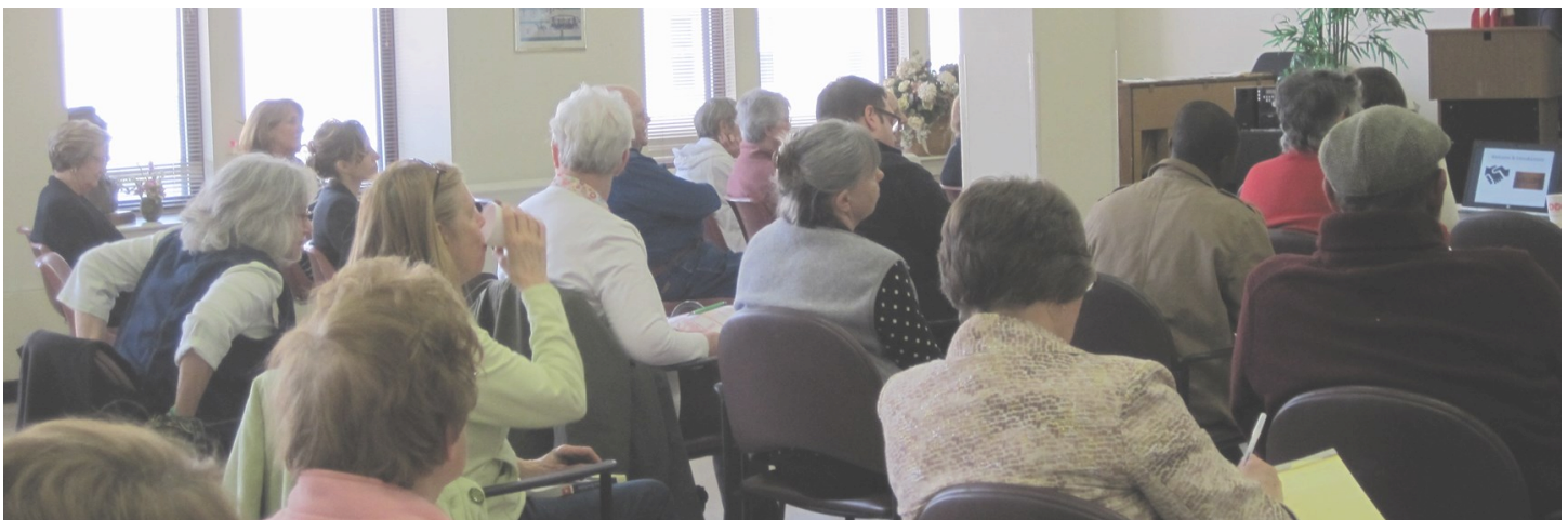
Image (above): Aging in Place forum participants at the Froio Senior Center in Pittsfield. In total, three forums were held across the county. Participants discussed the barriers they face to remaining in their own homes and communities as they age and identified potential solutions.