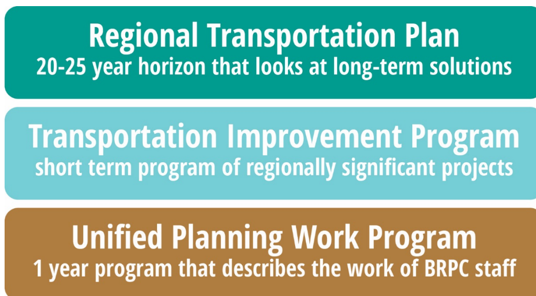
Figure 1: MPO Primary Work Products

In accordance with state and federal law requirements, 1 and to ensure inclusive and accessible public engagement processes for transportation decision-making, the Berkshire MPO has developed this Public Participation Plan (PPP or Plan). This PPP will guide the Berkshire MPO's public participation efforts that include outreach to populations traditionally underserved by the transportation system and/or have traditionally lacked access to the transportation decision-making process. This Plan guides the Berkshire MPO in its efforts to offer early, continuous, and meaningful opportunities for the public to help identify impacts of proposed transportation policies, projects, and initiatives across Berkshire County. This Plan shapes the Berkshire MPO's public engagement efforts, from instances of disseminating information to the more formal instances of public outreach in the transportation plan development and decision-making process.