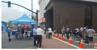
Image (above): BRPC Transportation Staff oversee 3 rd Thursday attendees hoping to get their chance to test ride an e-bike.

Transportation planning staff at BRPC would like to thank all those that attended Pittsfield's 3 rd Thursday event this past July—and specifically to those that were willing to hop-on and try out one of Bewegen's electric pedal-assist bicycles. It was a pleasure to see such warm reactions by those that test rode the e-bikes—as I'm sure anyone who has ridden one for the first time knows—they are an instant smile-generator.