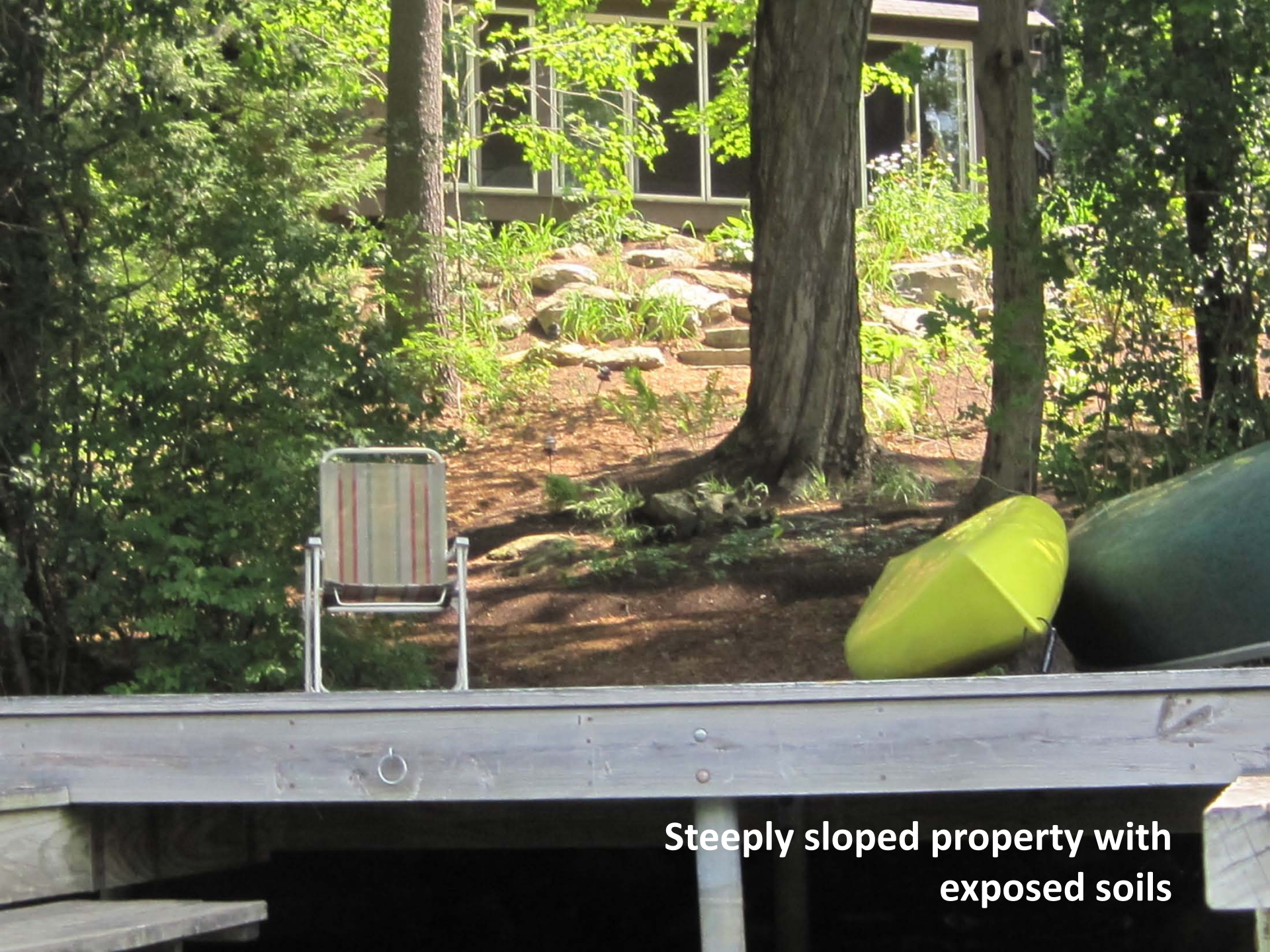
Steeply sloped property with exposed soils