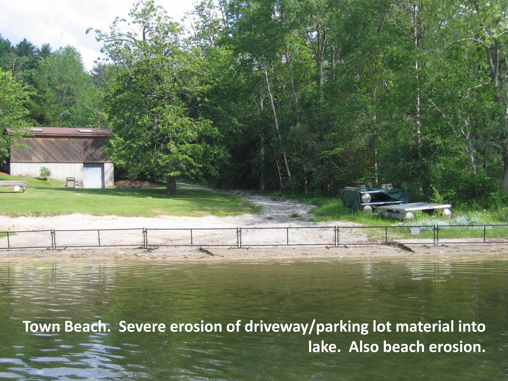
Town Beach. Severe erosion of driveway/parking lot material into lake. Also beach erosion.