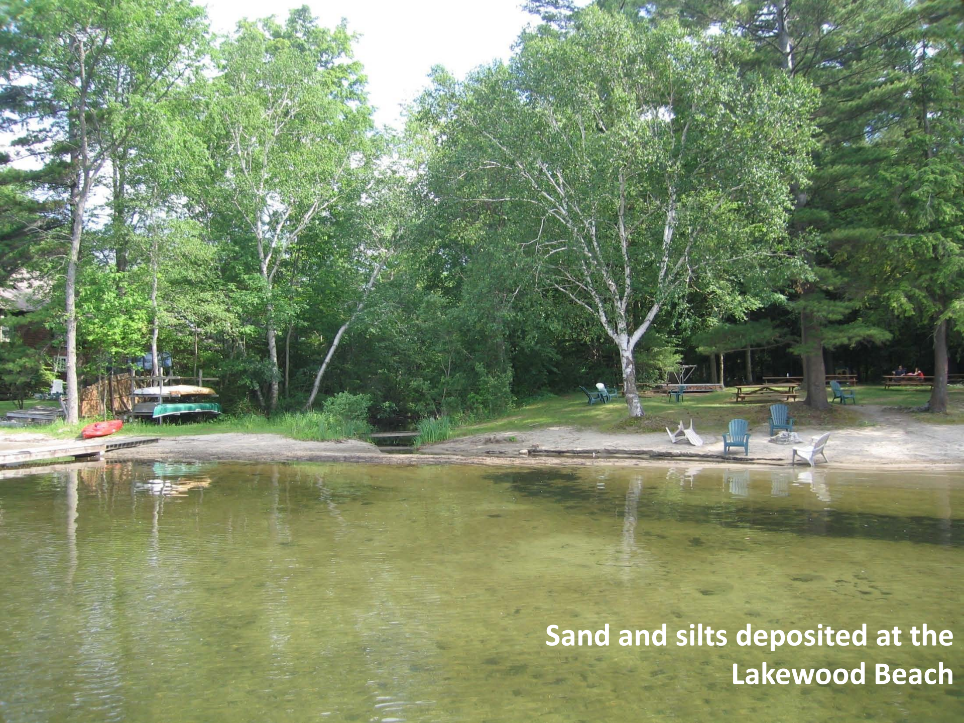
Sand and silts deposited at the Lakewood Beach