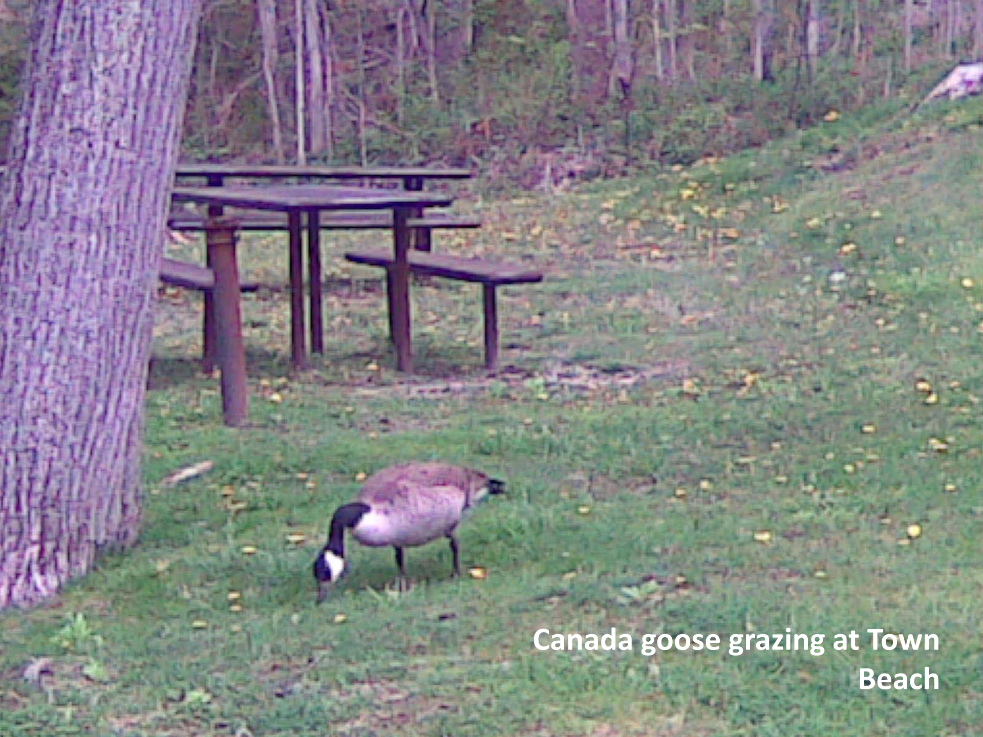
Canada goose grazing at Town Beach