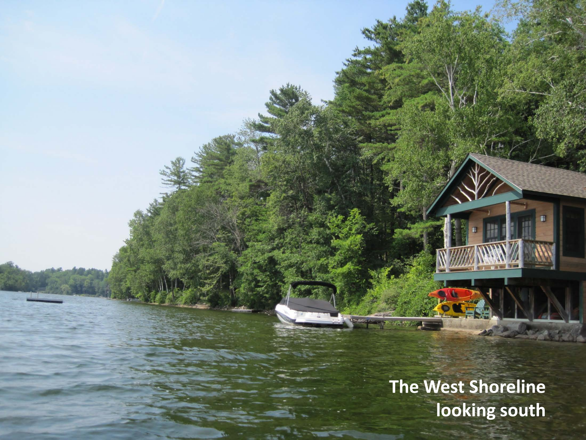
The West Shoreline looking south