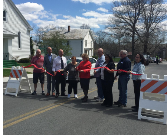
Hinsdale's Complete Streets Project: Church St. sidewalks and crosswalks part of five 2018 projects totaling $400,000