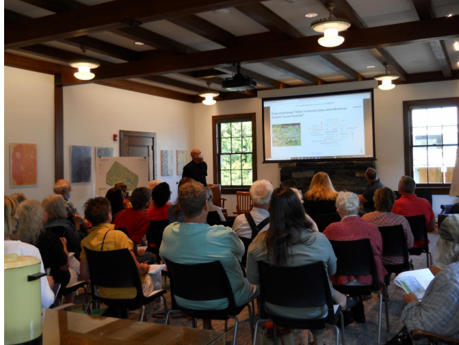
Monterey Master Plan Public Forum